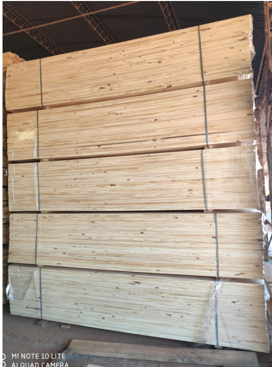
MI NOTE 10 LITE ALQUAD CAMERA