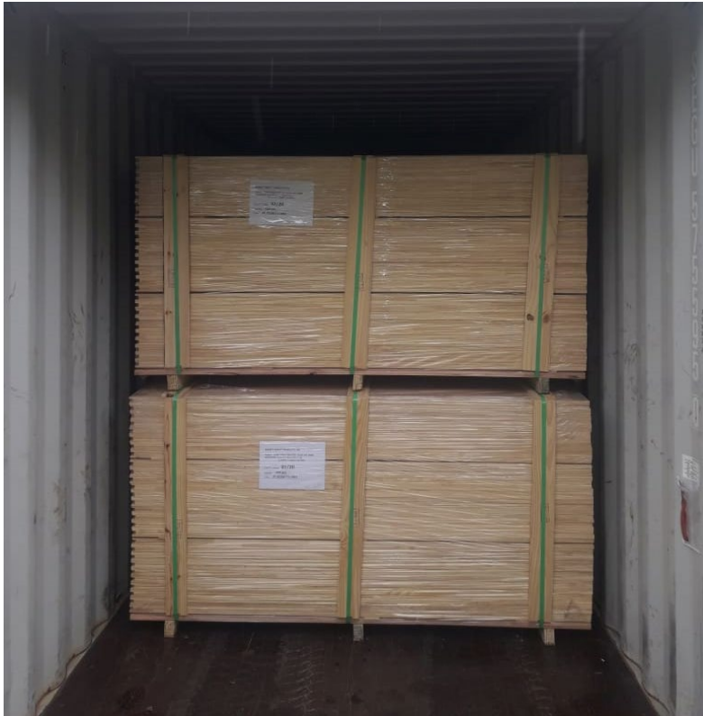
We take care of all importation process