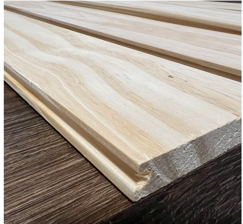
Clear pine paneling ("select")