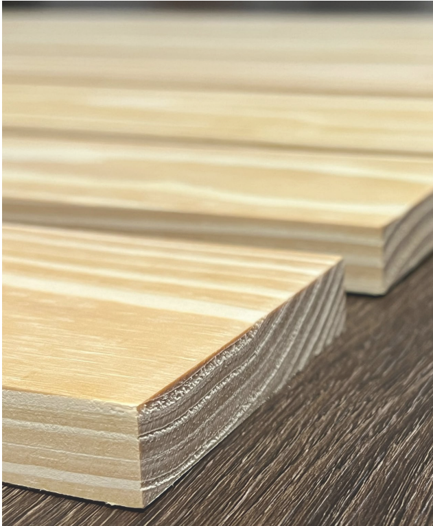
Clear pine moulding ("select")