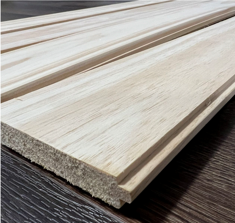
Clear pine paneling ("select")