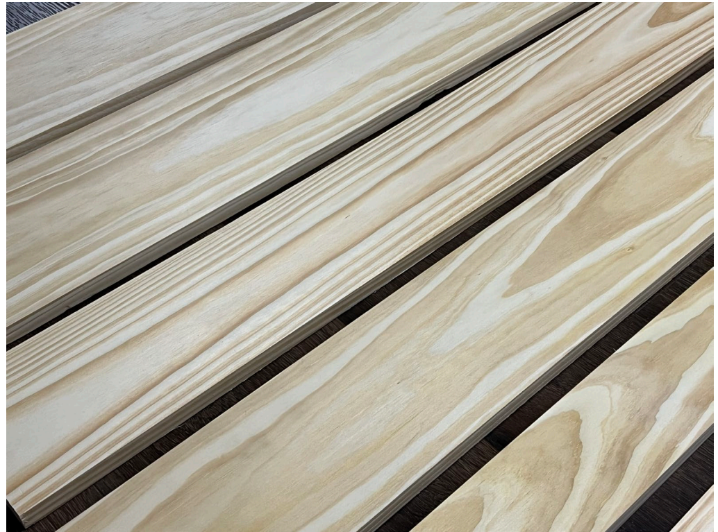
Clear pine moulding ("select")